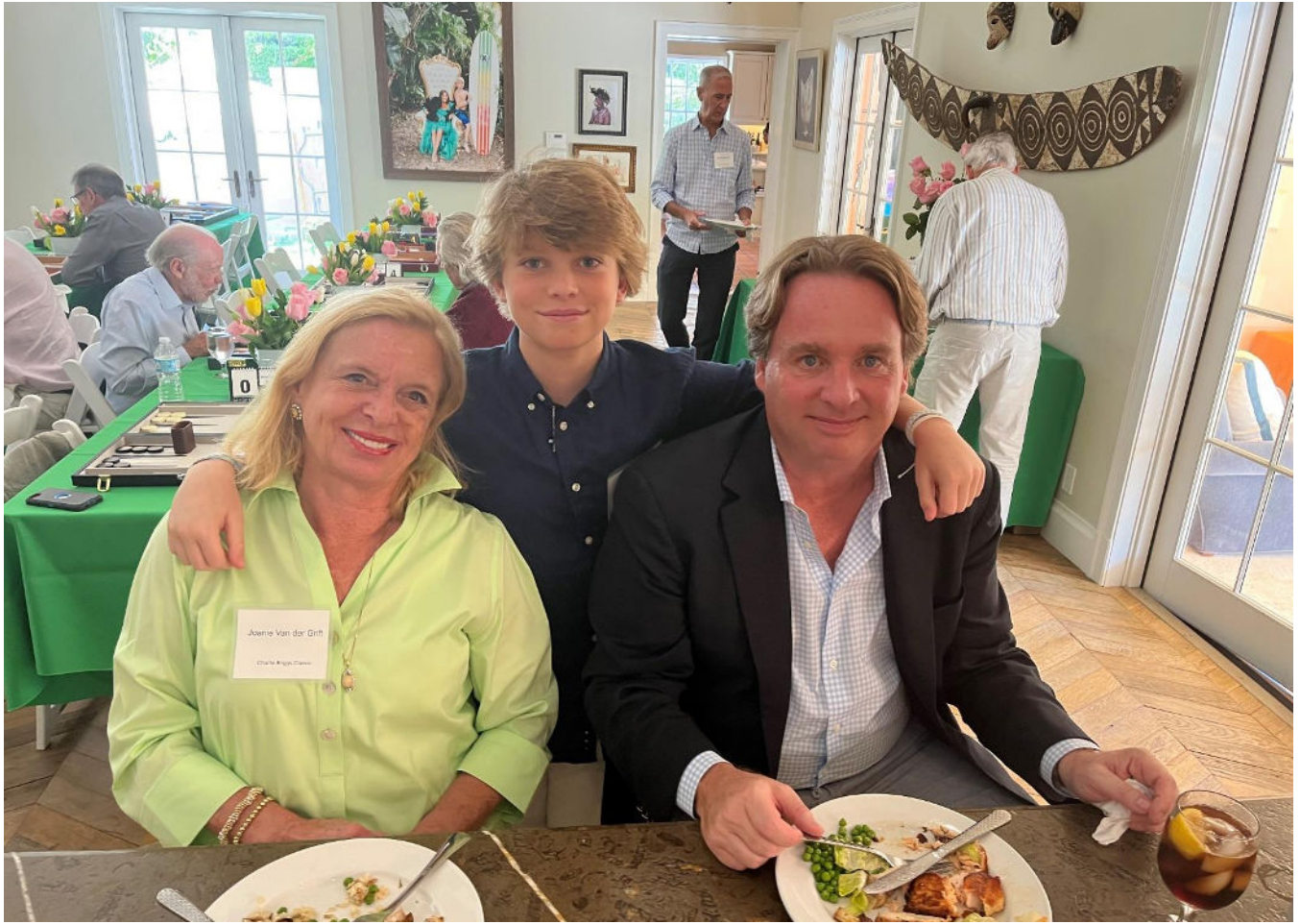
With Appreciation from Florida Outreach Center for the Blind to all participants!